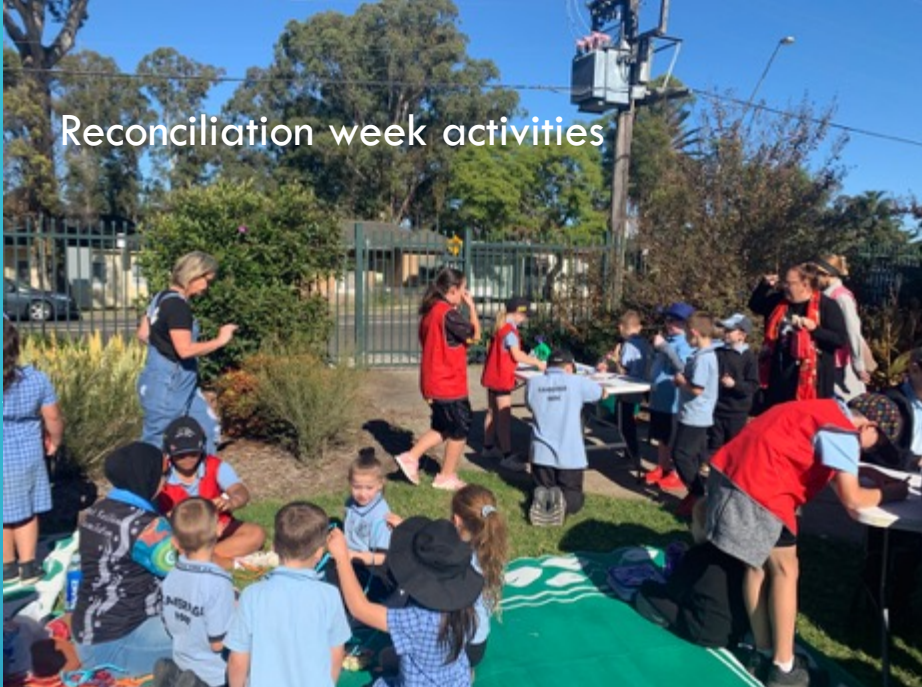
Reconciliation week activities