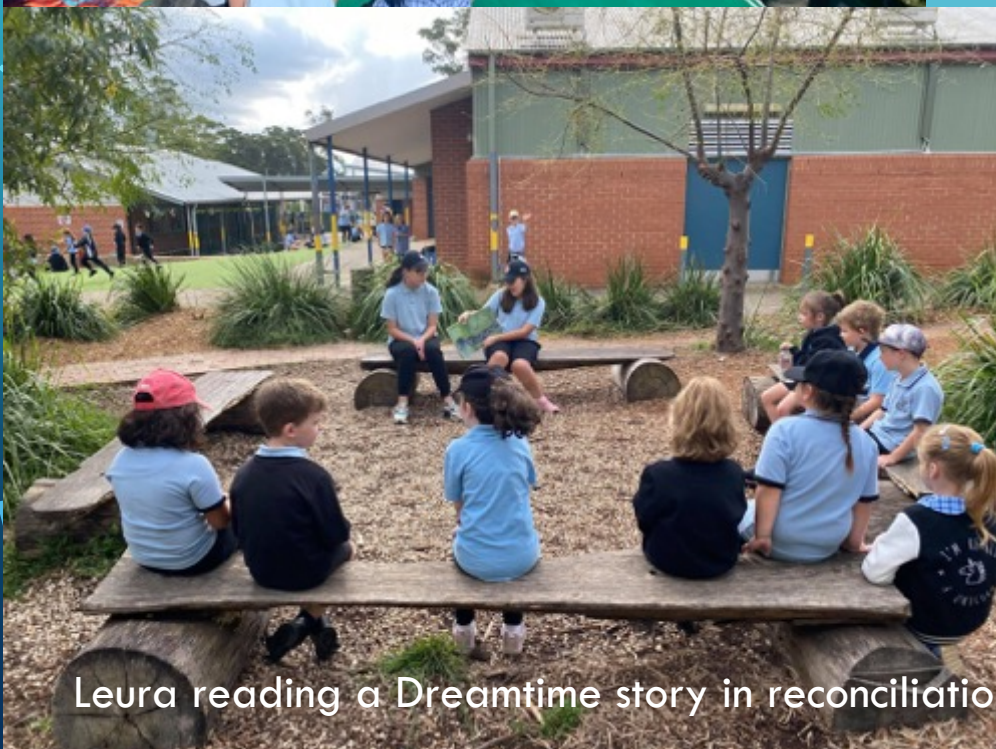
Leura reading a Dreamtime story in reconciliation garden