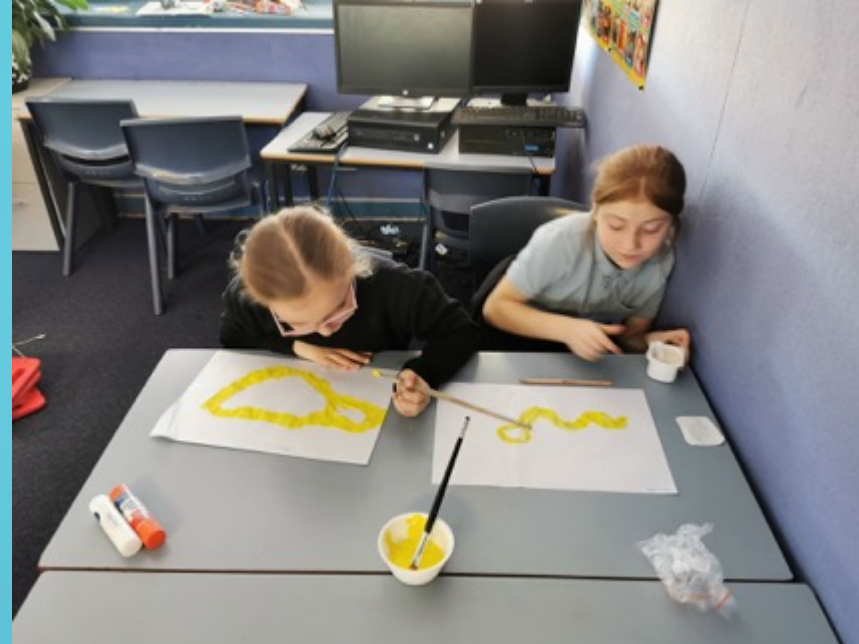
Maison leading an art lesson based on the Rainbow Serpent.