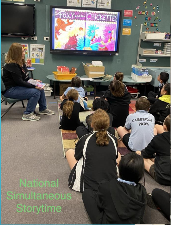
National Simultaneous Storytime