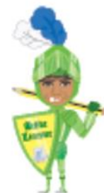
Sir Learn -A –Lot

You may have noticed some signage around the school that reminds the students of how to be Safe, Respectful, Active Learners in that part of the school. Each week teachers deliver a lesson about how to be Safe, Respectful, Active Learners in different parts of the school. For example, in the first weeks of school students are taught about being “Safe, Respectful, Active Learners” in the classroom. Each grade will have a slightly different emphasis according to the age and developmental level of the students.