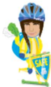
Lady Safe –A-Lot

In all those settings we want the children to be Safe, Respectful, Active Learners . We use our “Knights of Cambridge” mascots as visual reminders to students of what our expectations are. Meet: