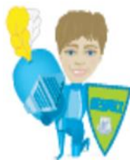
Sir Respect –A-Lot