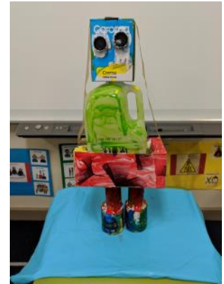
'RB' by Cayden